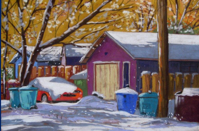
“Sunny Alley”, Pastel, 12”x16”

Parkdale Nifty Fifties is also the location of the next “Instructor’ Showcase. Mark March 2, 2024 on your calendar if you would like to see what we are up to!